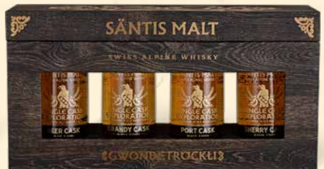
Sántis Malt 'Gwondetröckli', 4x10cl Our 'Gwondetröckli' set features four exquisite single-cask whiskies from various cask types. These highlight the impact that various types of wood and casks can have on the final product.