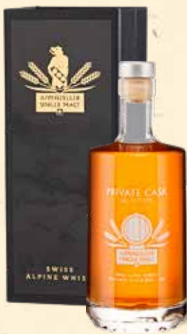
Black gift pack for 1 Private Cask Edition 50cl

Nature provides us with raw materials such as water, grain and wood. That is all we need to produce our Appenzeller Single Malt. An unprocessed, natural gift. Therefore, we take great care when handling our Sántis Malt. Below are some of the specially arranged sets, accessories and glasses to accompany our whiskies and showcase their elegance.