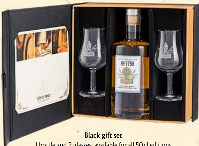
Black gift set 1 bottle and 2 glasses, available for all 50cl editions 50cl