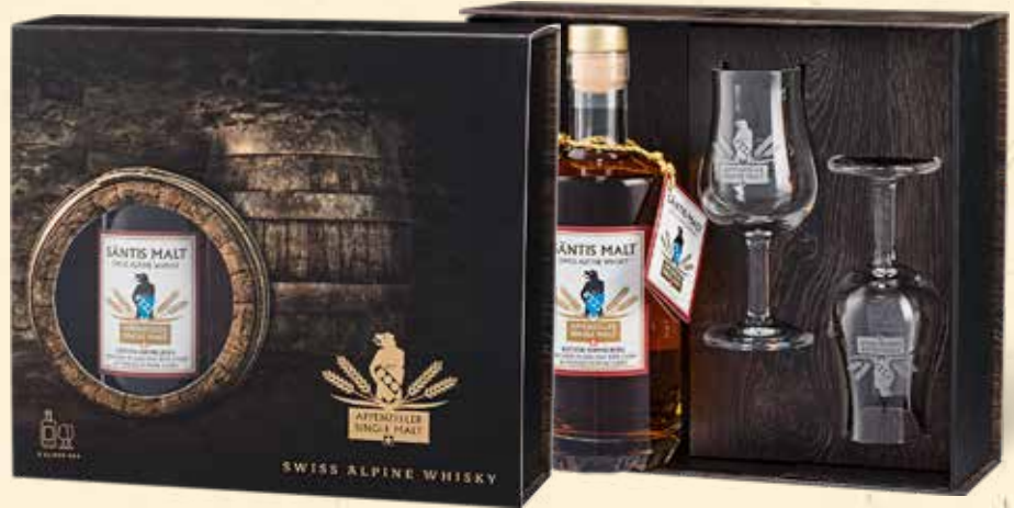
Nosing Set 1 bottle and 2 glasses, available for all 50cl editions 50cl